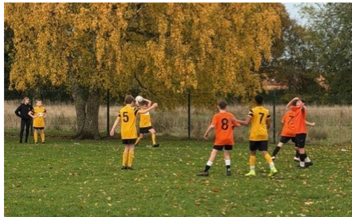
earlier this month. They played well with some great defensive moves supporting their strong attackers to make it through to the third round with an impressive 4:2 final score: great work boys!