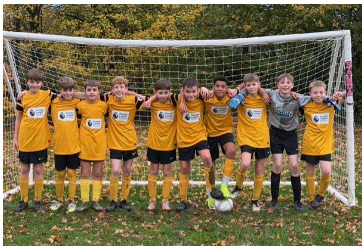
Congratulations to our boys' football team, who played St. John's in their second round match in the Hampshire Cup